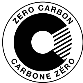
*ZCB Program logo